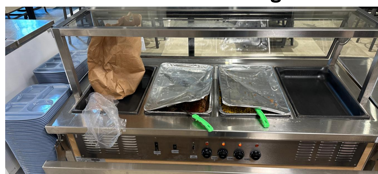
Figure 2. Picture from Environmental Charter Schools' Cafeteria