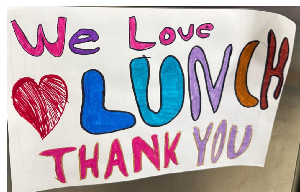
Figure 1. Picture from Environmental Charter Schools' Cafeteria